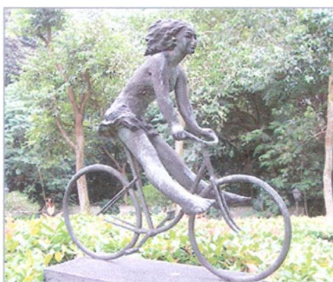
Taking a sculptured ride ...

That's nothing extraordinary, really, save for the fact that in 1955, Marshall became the first chief minister of Singapore under British rule. He was also a member of the tiny Jewish community there.