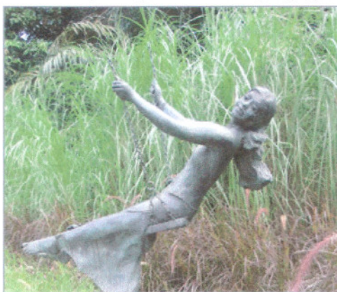
... and swing through the Botanic Gardens of Singapore.

The Singapore Jewish community is mostly Sephardic, tracing its ancestry to Iraq. From a small population of 40, the community grew to more than 1,500 in 1939. After World War II, many of its Jews immigrated to Australia, Europe and the United States. Today, the community numbers about 300.