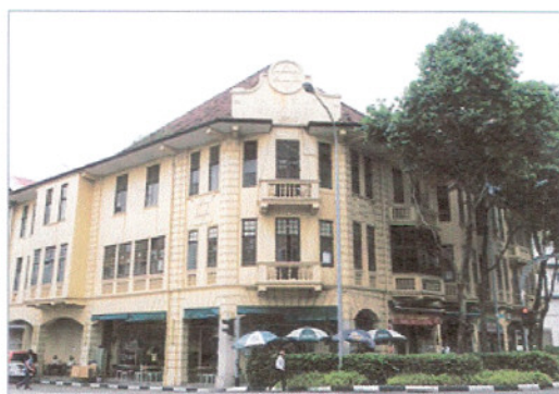
The picturesque Gill David Elias Building

The Jewish Welfare Board, staffed entirely by volunteers, manages the affairs of the tiny Jewish community. Rising up beside the Maghain Aboth is a brand-new Jewish community center that will house the country's very first Jewish restaurant.