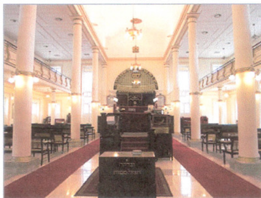
The interior of Maghain Aboth