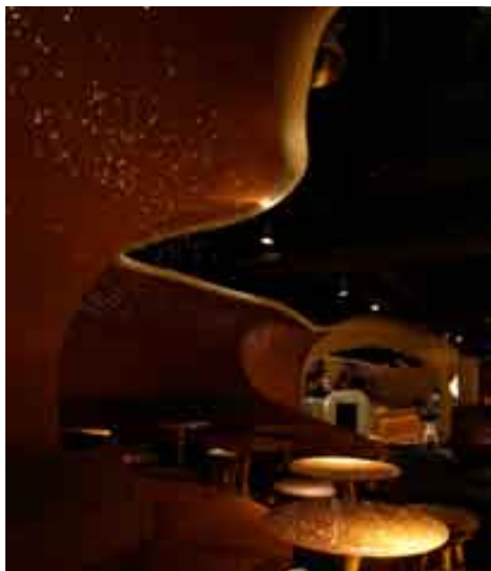
Clockwise from above: Saturday night fever: Zouk; Stark grandeur at Attica; Magical Mystery Tour: the Majestic Bar.

Singapore's nightlife scene is constantly changing and offers just about any type of (legal) nocturnal entertainment. From the granddaddy of the club scene Zouk to newer stomping grounds like Prive and Majestic Bar, the choices are varied and many for the clubbers, lounge lizards and vinophiles. The venues are spread out across the island from Orchard Road to the downtown business district centred around Raffles Place, to the ethnic enclaves of Chinatown and Kampong Gelam. Further afield, the Harbourfront and Sentosa areas also offer exciting choices.