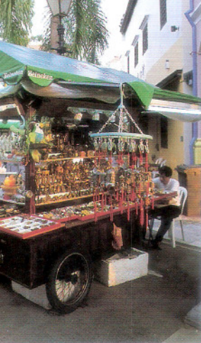
Traditional souvenir vendor on Clarke Quay.

Raffles Hotel souvenirs at its museum shop. The Raffles City Shopping Centre (252 North Bridge Road) nearby is linked to Suntec City Mall by an air-conditioned walkway and shopping mall, appropriately dubbed the CityLink Mall (1 Raffles Link).