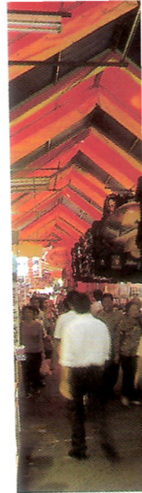
Bugis Village bargain

set price, make for interesting browsing. You will find items that you have never seen before. Keep an eye out for the ABC Bargain Centres as well as the Valudollar shops in the suburban areas. Other discount chains to look out for in the malls include Sasa (for cosmetics), Export Fashion and also Why Pay More . Over at the Cavallino Recycle Shop (01-45 Tanglin Shopping Centre, 19 Tanglin Road) are designer fashions and accessories at half price.